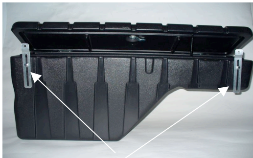
Fig. 2 Install Brackets to Box