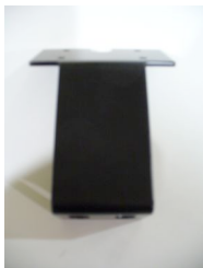
(Fig. 1) Part #60XXB 2005-2006 Rhino