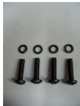
#10-32 Screws Lock Washers