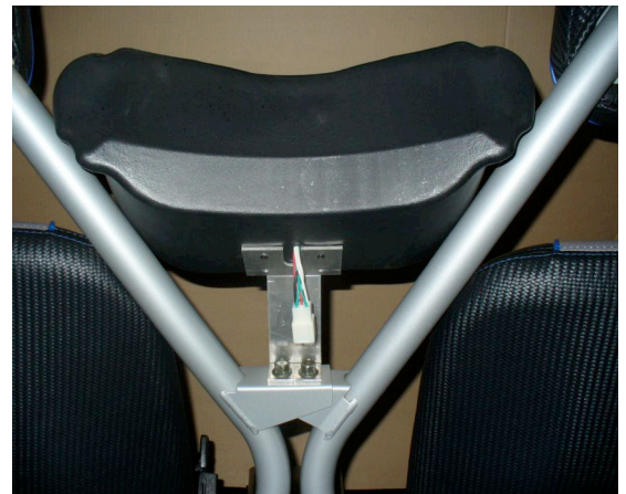
REAR VIEW INSTALLED

Vertically Driven Products 1401 Freeman Avenue Long Beach, CA 90804 (562) 438-5112 info@vdpusa.com