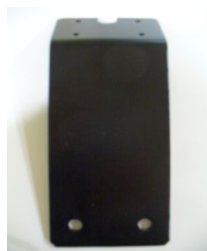
(Fig. 2) Part#60XXCB 2007-Current Rhino