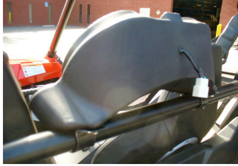
Installed Rear View