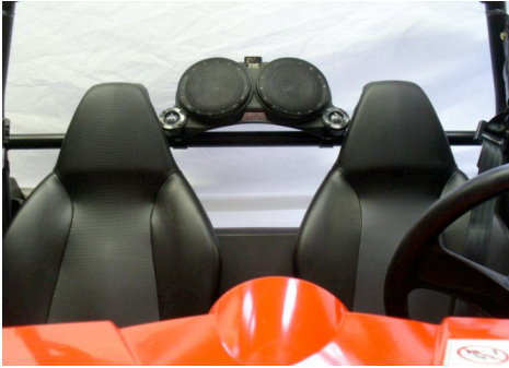
Installed Front View