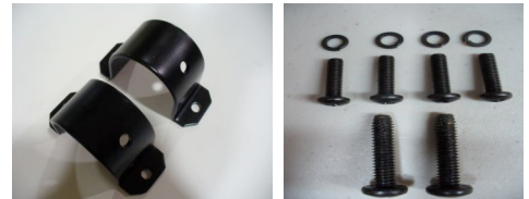
Part #70XXB (For 1.5" Bar)

Vertically Driven Products 1401 Freeman Avenue Long Beach, CA 90804 (562) 438-5112 info@vdpusa.com